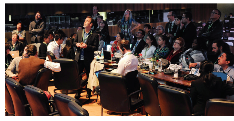
A group of IPBES members finalizing amendments to the summary for policymakers of the Global Assessment Report in 2019.

First, who are the experts who make up the membership of the SPI? At the global level, it is not surprising the focus has often been on achieving geographical diversity of members. Increasingly, the focus on ensuring representation has also included age, career stage, gender, and institutional affiliation. In establishing a new SPI, it is important to clarify whether experts are serving in their individual capacity or as government representatives, or whether there is a need for both types of appointments. Indeed, this dual approach in both IPCC and IPBES has facilitated government buy-in of their reports.