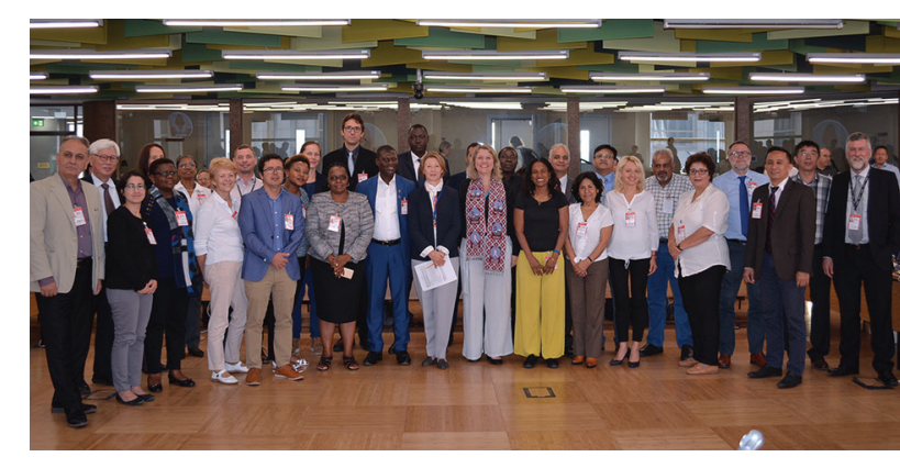
The Stockholm Convention's Persistent Organic Pollutants Review Committee is an example of a limited membership expert committee.

at bridging the enduring gulf between science and policy are now called sciencepolicy interfaces (SPIs); many operate in the arena of global environmental governance. Among these, the Intergovernmental Panel on Climate Change (IPCC) has come to be the most visible model of such institutions. This prominence is reflected in calls for an "IPCC for land" (Chasek, 2019), an "IPCC for food systems" and an "IPCC for chemicals and wastes." Other models include SPIs that are subsidiary to a single treaty, such as the Stockholm Convention's Persistent Organic Pollutants Review Committee. Given enduring and worsening global environmental challenges, what lessons have been learned over the last five decades to live up to the ambition in Principle 18?