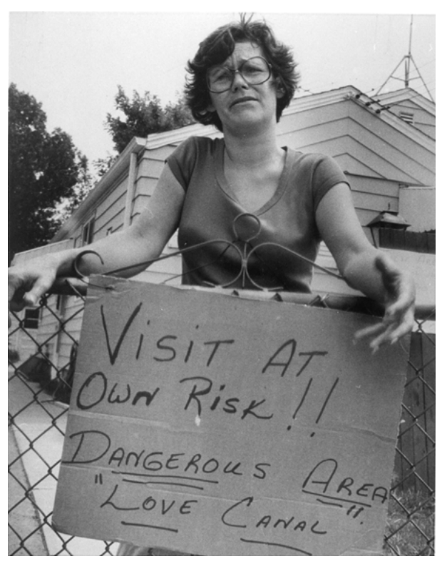
Houses and a school were built on top of 22,000 tons of chemical sludge, that were legally dumped around Love Canal in New York State.

1972, and the Convention for the Prevention of Marine Pollution from Land-Based Sources (the <u>Paris Convention</u>), adopted in 1974. They added to the growing international interest in the problem but were limited to seas and oceans near developed countries.