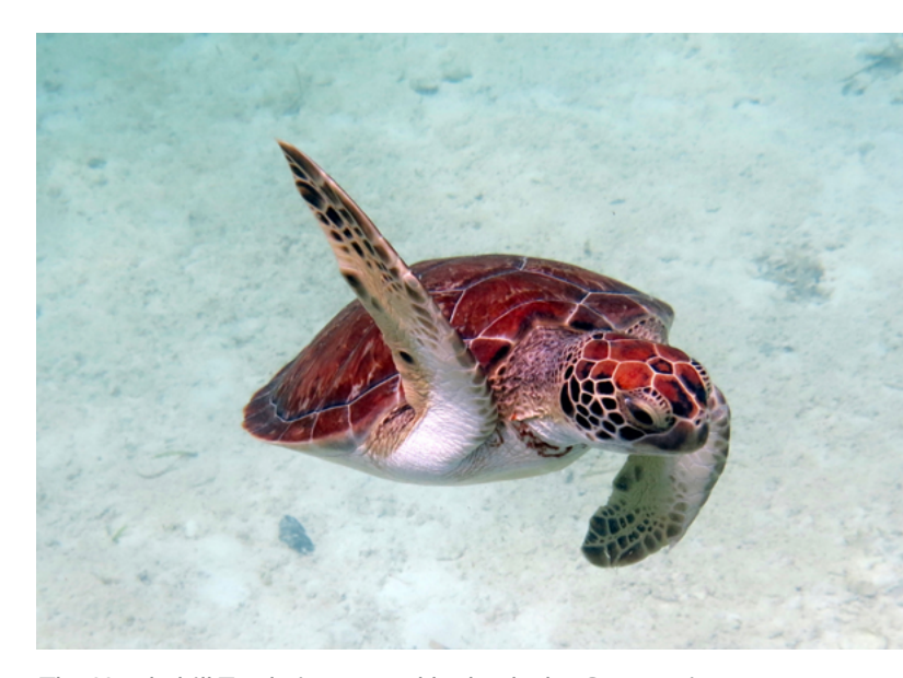
The Hawksbill Turtle is covered by both the Convention on Migratory Species and the Convention on International Trade in Endangered Species of Wild Fauna and Flora

AMB. ARVID PARDO, 32ND SESSION OF THE UN GENERAL ASSEMBLY. 1 NOVEMBER 1967.