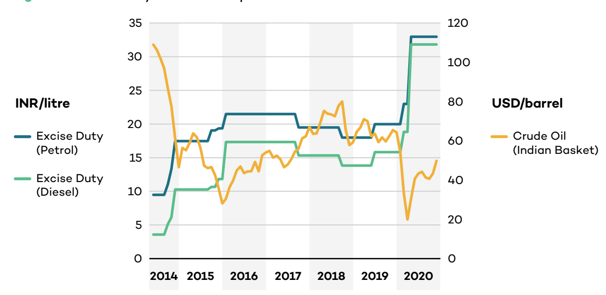
Figure 2. Excise duty vs. crude oil price in India.

Since 2019, the excise duty has been increased several times with falling world oil prices. This demonstrates that India is using a variable tax regime, albeit one applied in an ad hoc manner. The ad hoc adjustment of taxes is problematic because tax fluctuations are unpredictable for consumers and are determined by political decision making rather than established rules (therefore, a temporary tax cut could easily become a permanent subsidy). A transparent mechanism with specified triggers and limits for tax reductions and increases would reduce both uncertainty and the risk of political (rather than economic) decision making.