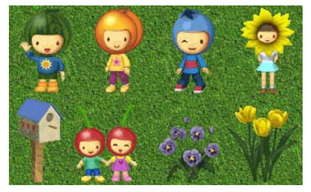
Figure 3: (Lil) Green Patch Graphics

Since Facebook enabled third-party development of applications that integrate with its main databases of member information, individuals and organizations have begun to experiment with the creation of additional tools for sustainable development, most successfully for fundraising for on-theground environmental actions. The most