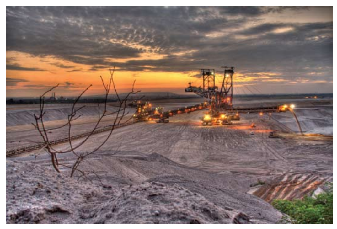
Investment Treaty News Quarterly is published by the International Institute for Sustainable Development

IISD contributes to sustainable development by advancing policy recommendations on international trade and investment, economic policy, climate change and energy, measurement and assessment, and natural resources management, and the enabling role of communication technologies in these areas. We report on international negotiations and disseminate knowledge gained through collaborative projects, resulting in more rigorous research, capacity building in developing countries, better networks spanning the North and the South, and better global connections among researchers, practitioners, citizens and policy-makers.