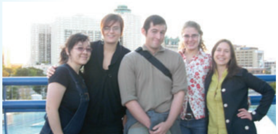
CYL interns: “The term ‘northern’ refers to a way of looking at the world and a general attitude.”