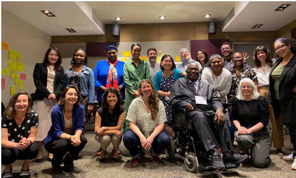
Knowledge co-production workshop participants (please see page 14 for a list of names and affiliations).

For a topic like intersectionality, in all of its complexity, a co-production process felt essential. The participants in the workshop each brought professional and lived experience that was generously shared to advance our collective understanding of what an intersectional approach to adaptation could look like in practice. Our facilitators guided us through a process where each person was invited to reflect on their own positionality and where we developed a common language for dialogue on the issues under discussion. All knowledge was valued, and the focus was on learning with and from each other, using different techniques that invited inputs in different forms. This enabled us to have open and honest conversations and evolve our thinking throughout the workshop. We engaged with the complexity of intersectionality, acknowledging its context-specificity, the challenges in disrupting power structures, and the need for an iterative approach to get it right. There remain many questions about applying intersectionality to adaptation policies and action, but ultimately, we had a small community that felt we had created something together.