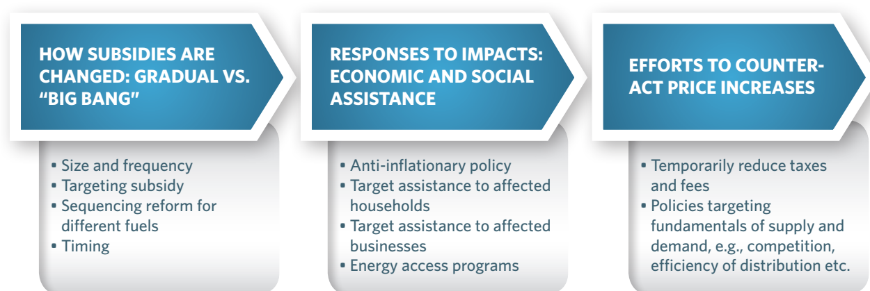
FIGURE ES1 | TYPES OF MITIGATION MEASURES FOR FOSSIL-FUEL SUBSIDY REFORM

Build credibility concerns into the design of mitigation measures. Stakeholders may view plans skeptically, particularly if accountability and transparency are thought to be poor. Transparent preparation and the pre-emptive introduction of mitigation measures—before price rises take place—can build trust.