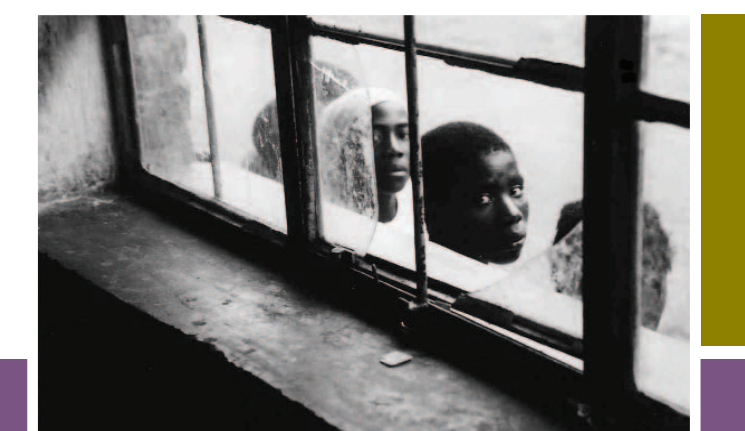
Former child solidiers at a transit centre in Kalehe, Democratic Republic of the Congo.

The WTO's Doha declaration of 2001 agreed to a 'reduction of, with a view to phasing out, all forms of export subsidies.' At the Hong Kong Ministerial meeting of the WTO in December 2005, the OECD countries finally agreed to phase out all export subsidies by 2013, in return for some limited concessions on the liberalization of trade in services However, this phase-out period is much longer than that sought by many developing countries and there is a danger that the OECD countries will funnel the resultant savings into greater domestic subsidies. In short, the tentative agreement's impact on a heavily distorted trading system is both uncertain and delayed.