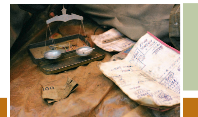
Comptoir, Democratic Republic of the Congo.

However, voluntary initiatives suffer several weaknesses, the most apparent of which is the partial, self-selective nature of self-regulation. Smaller companies, state-owned enterprises in non-OECD countries, and independent rogue actors are often insulated against 'naming and shaming' and hence have few incentives to sign on. Second, industry self-regulation has led to a proliferation of voluntary codes, none of which have global reach and authority. Third, self-regulation often lacks transparent reporting, clear performance criteria and reliable monitoring mechanisms. Fourth, voluntary efforts to do good by individual companies may be undercut not just by other less scrupulous companies, but by host governments unconcerned or unable to address issues of corruption, criminality and conflict.