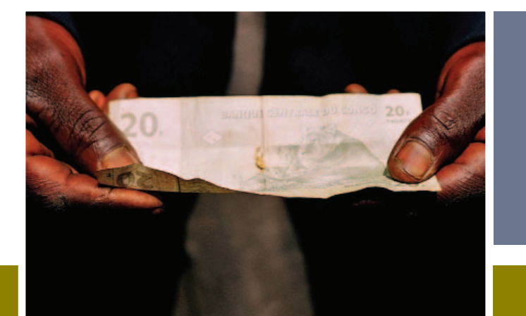
A gold miner in the Democratic Republic of the Congo shows his takings.

With two recent coup attempts in 1995 and 2003, São Tomé e Príncipe's potential oil wealth has raised great concern for the future of the tiny archipelago. The 2004 Oil Revenue Management law provides extensive guarantees in terms of transparency, accountability and governance. The law creates a fund that directly receives all oil revenue, which is held by an international custodial bank. All financial information is to be made transparent, fund withdrawals are done on an annual basis only with a ceiling determined by future production potential, and borrowing against present or future oil revenues is prohibited. Despite this exemplary framework, the Prime Minister and government resigned in June 2005, arguing that the President had negotiated and signed new Production Sharing Agreements without proper consultation.