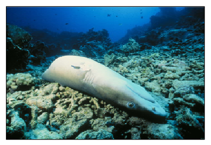
Wild Aid, 2004

The illegal trade of natural resources, such as wildlife and tropical timber, is a global problem of huge scale; driving conflict, promoting corruption and rewarding criminals. It also destroys biodiversity and undermines livelihoods. It is an issue that intersects environment and development. However, all is not lost. Solutions are possible but need political will and concerted effort.