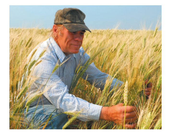
"We planted crops which handle moisture better—less flax, more wheat and barley on the drier land."

The emphasis on short-term coping strategies reflects the higher financial and labour costs associated with taking long-term adaptation measures (like buying new technologies, investing in infrastructure and making major landscape changes). It also suggests that the uncertainty associated with how permanent weather-related changes might be—were the excessive moisture conditions the start of a long-term trend?—makes it difficult to commit to investing in longer-term measures, particularly at a time when economic margins are already tight.