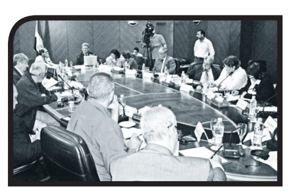
MIDDLE-EASTERN JOURNALISTS LEARN ABOUT BIOFUELS

Each of these forums, which are organized in partnership with the Inter Press Service news agency, takes as its starting point an issue that is particularly relevant to the region. In the case of Alexandria, it was the rising cost of food, a situation that has led to mass protests in Egypt and elsewhere. Journalists from across the Middle East heard from a variety of regional and international experts, including members of the HLAG, on the factors that were contributing to sky-rocketing food prices. One of the key