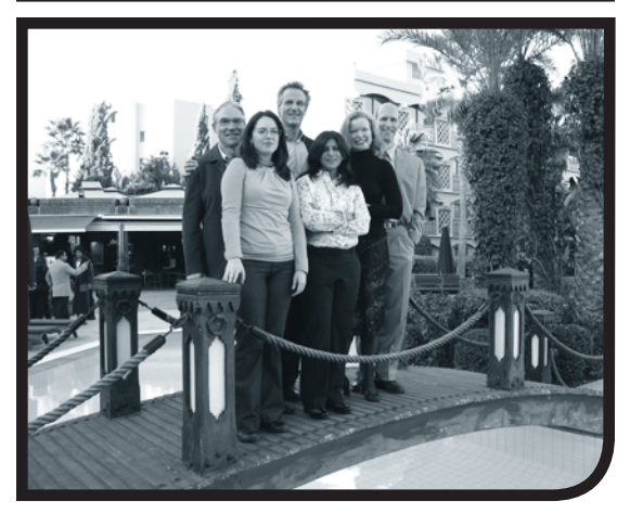
THE IISD TEAM IN MARRAKESH.