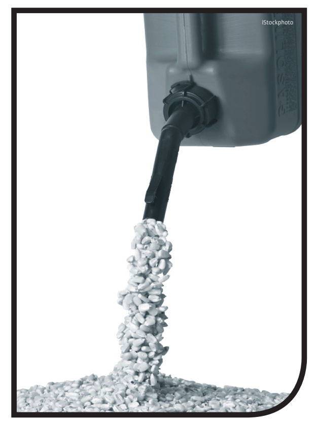
THE GSI EXAMINES THE IMPACT ON SUBSIDIES TO BIOFUELS THROUGH NINE REPORTS

An area of work that bridges IISD's research on investment and subsidies is "investment incentives"—government subsidies used to induce investors to choose one location over another. In November, the GSI published its first report on this topic, entitled "Investment Incentives: Growing use, uncertain benefits, uneven controls" (see http://www.globalsubsidies.org/ IMG/pdf/GSI_Investment_Incentives.pdf). As the title implies, governments at all levels are spending an increasing amount of public money on attracting investment capital. The benefits of that spending, however, are in many cases debatable. A seminar to discuss the findings of the report was held in November in Geneva, featuring presentations by the report's author, Dr. Kenneth P. Thomas, and Dr. Howard Mann, IISD's Senior International Law Advisor.