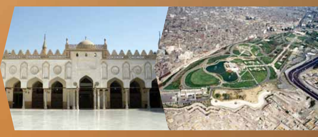
(Left) Al-Azhar Mosque, Cairo, Egypt and (Right) Aerial view of Al-Azhar Park, Cairo, Egypt.

"If things are going to change... it has to be done at the community level, and be culturally sensitive."