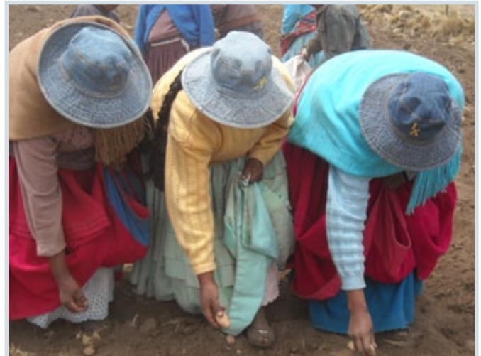
A group of women learn and implement new agriculture techniques as part of the PRAA project in Bolivia.

While farming and livestock activities remain important, mining (extraction of gold and the presence of a deposit of calcium carbonate) has recently become a complementary