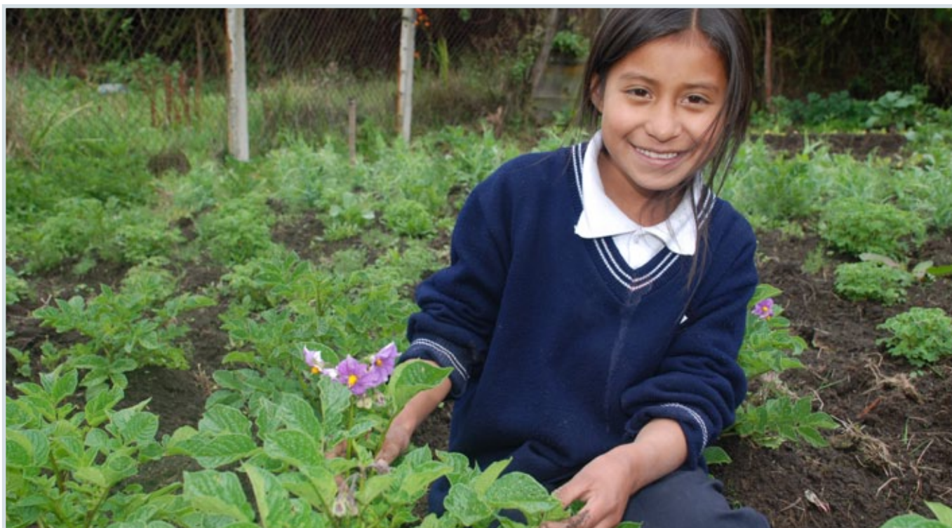
As part of the PRAA project, students aged 7-8 years old from the Quisquis school in Papallacta, Ecuador, are learning how to do maintenance on their school garden. They are weeding the lettuce, acelga and papa nabo crops. These vegetables are used to improve the nutrition of the school children by adding these vegetables to the lunches provided by the school.

It is important to validate the results obtained from the application of the tools with the communities.