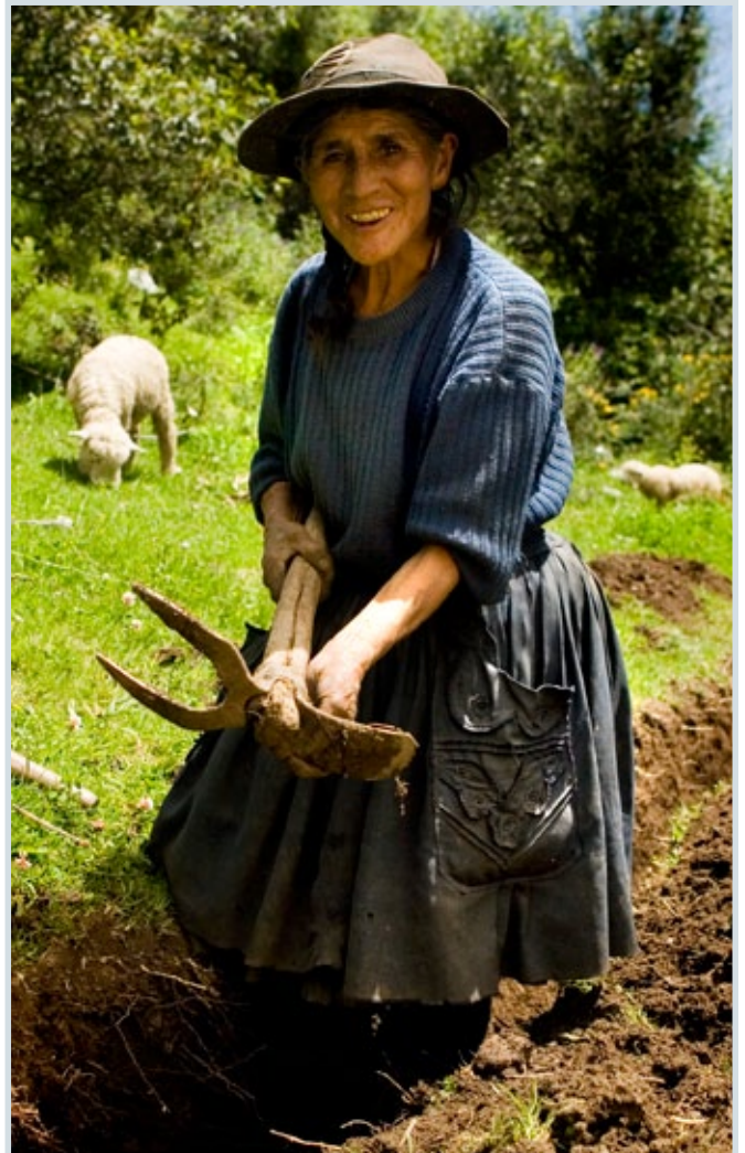
A woman in Shullcas, Peru, digs a canal to capture water from rain and glacial melt for irrigation purposes as part of the PRAA project that is implemented by CARE Peru.

One CVCA instrument that enabled the identification of at-risk groups was the Community Mapping tool. This tool has among its objectives to identify the location of vulnerable zones and/or the most vulnerable social groups. In Peru, for example, the most vulnerable groups identified were women responsible for families and older adults responsible for families (as they often have lower mobility). In Bolivia, it was observed that in places where most men do non-agricultural work – such as mining, for example, the women take responsibility for agricultural activities and caring for their families. This makes them more vulnerable to any negative impact on crop production. It was also women who most vocally expressed their concern for water quality, and threats to crops and health. Younger children were also mentioned as being vulnerable, because they are more likely to suffer from respiratory illness from low temperatures.