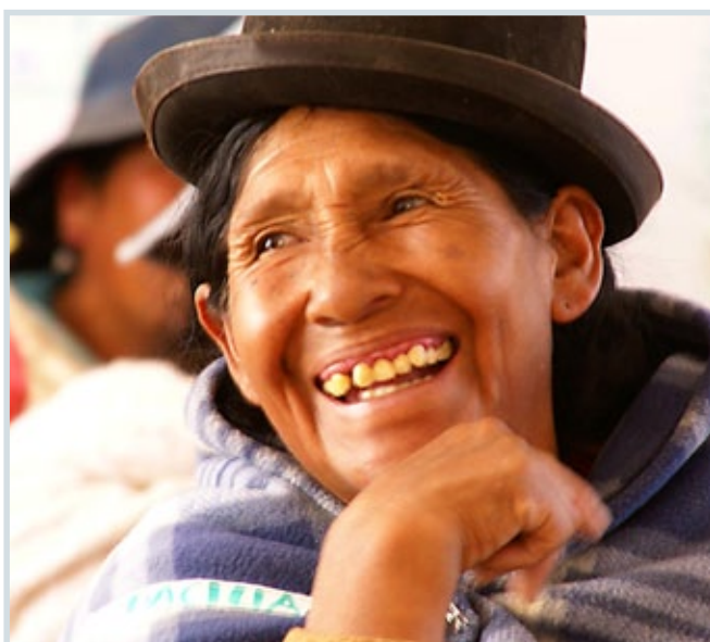
A woman from Tapacaya, Bolivia, takes part in a CARE-led CVCA workshop in her village.

CARE is implementing adaptation measures under the Pilot Project 2 in the municipalities of Batallas and Palca and considering three micro basins. The micro-basin of Cullucachi corresponds to Lake Titicaca sub-basin and is located in the municipality of Batallas in La Paz department, near the Huayna Potosí glacier. It is made up of 10 communities located at different altitude levels and has a population of nearly 1,350 families of Aymara origin. The main activities are farming of potatoes, quinoa, fava beans, barley and oats, and raising cattle, camelids and sheep.