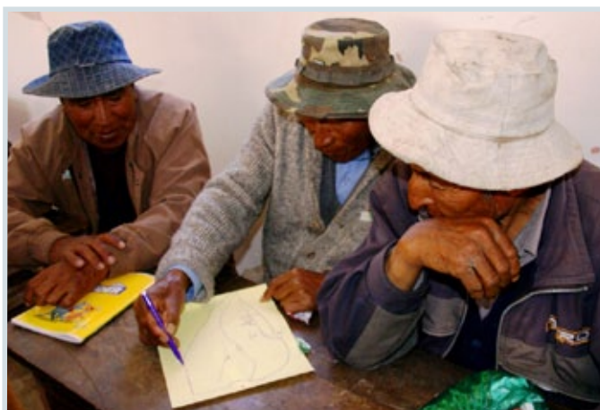
Local residents from Tapacaya, Bolivia, work together on CARE’s Climate Vulnerability Capacity Analysis (CVCA).