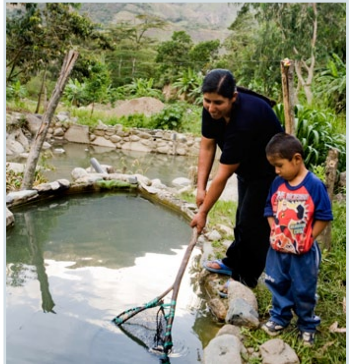
As part of an income-generating activity through the PRAA project, CARE is supporting this trout farm in Santa Teresa. The fish farm is operated by a local women's association.

The district is dominated by subsistence agriculture, with crops such as coffee, plantain, maize, avocado and passion fruit. The entire area is of great natural and cultural importance, as it is adjacent to the historic sanctuary of Machu Picchu, and is therefore an area with tourism potential. Nevertheless, Santa Teresa is located in a vulnerable zone with a history of landslides, mainly due to debuttressing of the Salkantay glacier.