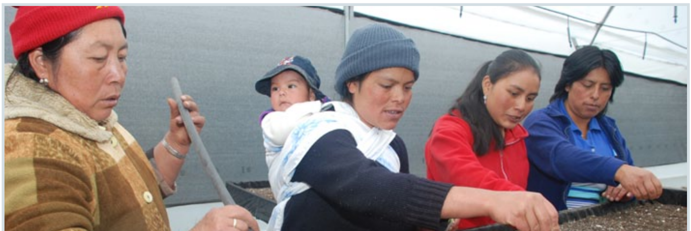
Through the PRAA project in Ecuador, groups of women aged 19 to 70, belonging to the Valle del Tambo community, gain knowledge and skills. They work in a local green house for planting vegetables like lettuce, cauliflower, carrots, and beets. The farmers are mothers who did not previously have vegetable gardens.

Public investment in education and health is limited;