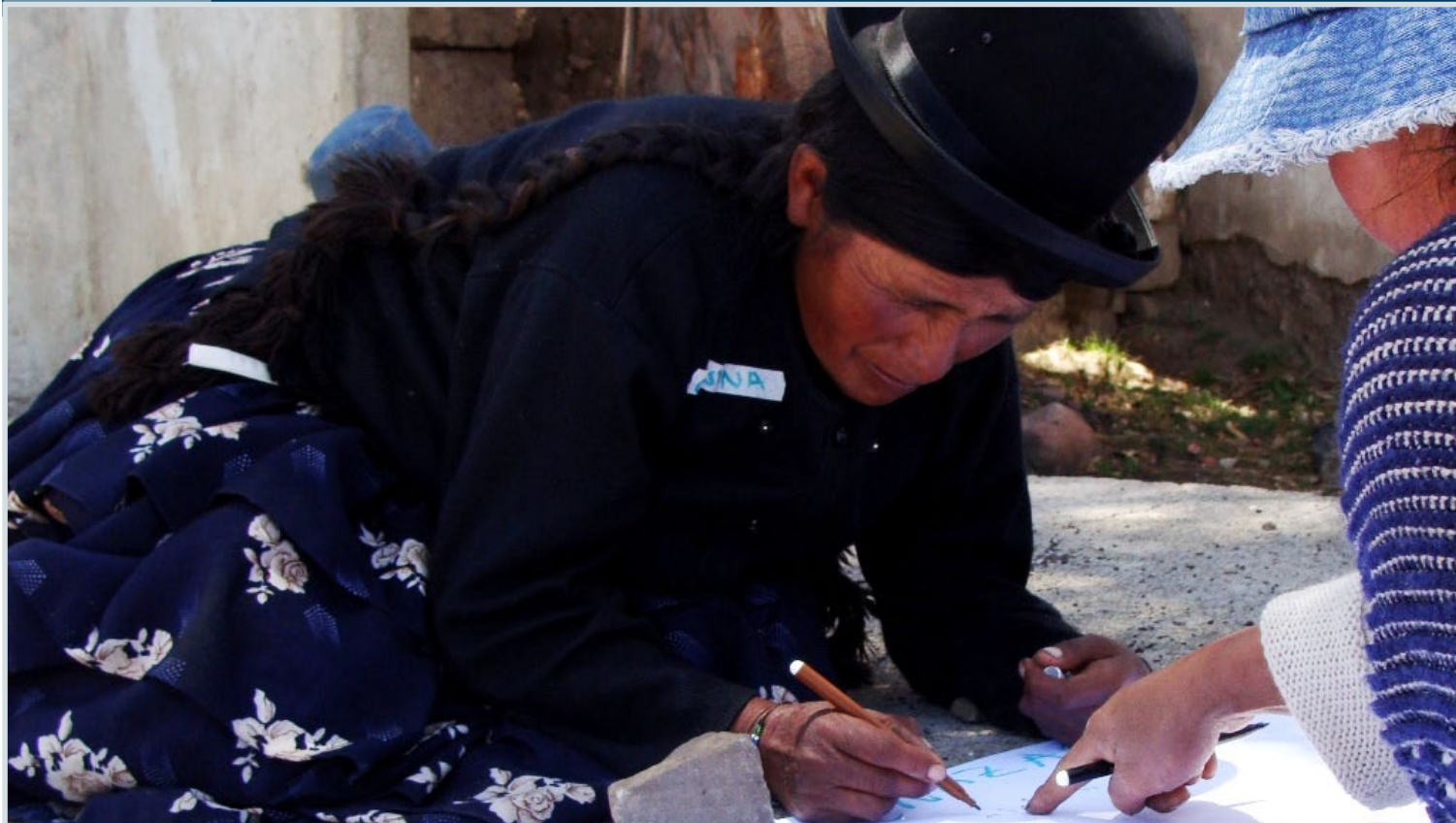
Two local women from Tapacaya, Bolivia, work together in November 2010 on a participatory exercise as part of CARE's Climate Vulnerability Capacity Analysis (CVCA).