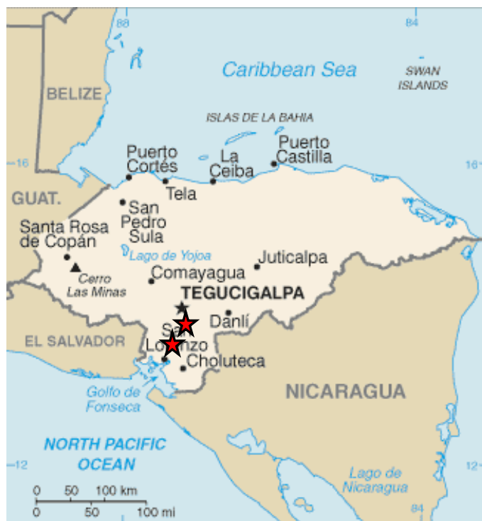
Figure 1: Map of Honduras and Project Areas of Lepaterique (upper star), and Pespire (lower star).

Initially, the assessment was meant to be carried out with CRiSTAL, a climate change adaptation tool (s. Box 1). However, due to the requirements of HEKS as well as based on local circumstances, a new tool, the Climate Proofing Tool, which includes mitigation, was elaborated.